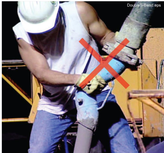
Figure 5 A double S-bend in use on a job, causing a needless hazard to the hose-person.

Eliminating the double-ended end hose makes a 'ram's horn' or 'double S-Bend' device impossible to attach. (See Figure 5). These devices are also not acceptable or recommended. They add even more mass and multiply movement to a greater degree than a delivery hose alone. The ACPA has informed the DOT of the states that requires their use, (for prevention of air loss) that these devices are hazardous and must not be used. See the ACPA Safety Bulletin Double S-Bend/Rams Horn ©2009 ACPA, all rights reserved.