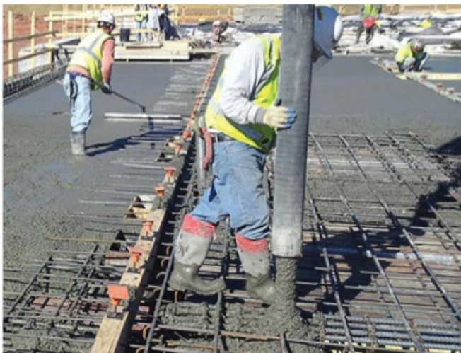
Figure 4 Be sure the discharge end is equipped with an end hose, not a delivery hose.

According to ASME B30.27, paragraph 27-3.1.3.3.1(r), not using a concrete delivery hose as an end hose is an operator responsibility. ASME B30.27, Material Placement Systems, is the American National Standard for pumping and concrete conveyor safety.