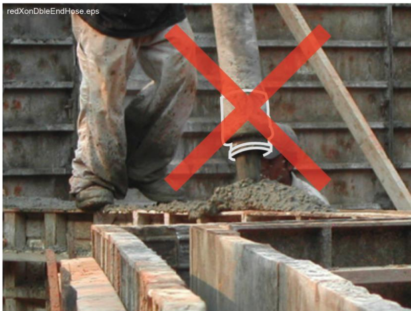
Figure 2 A double-ended concrete delivery hose improperly being used as an end hose.

Double-ended concrete delivery hoses increase the potential for serious personal injury when used as an end hose. A double-ended concrete delivery hose has mass attached to the end of the hose, multiplies momentum, and has the potential to cause serious injury or even death to persons in its path, should the hose move unexpectedly or whip as a result of the release of trapped air. It is imperative that you only use a single-ended end hose at the discharge of the boom and on the discharge-end of lay-down placing line. (See Figure 2).