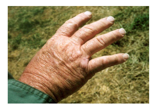
Workers who don't use PPE are exposed daily to even mildly irritating substances and are likely to develop serious skin problems such as irritant dermatitis

• Eye damage from chemical burns can be very serious causing the alkaline to gradually damage the inside of your eyelids or your eyes.